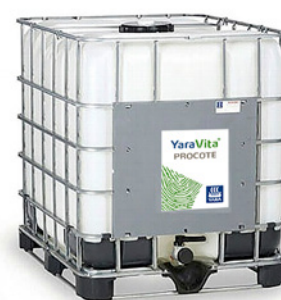
Delivered to retailers as liquid coating

The information provided is accurate to the best of Yara's knowledge and belief. Any recommendations are meant as a guide and must be adapted to suit local conditions.