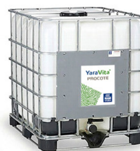
Delivered to retailers as liquid coating