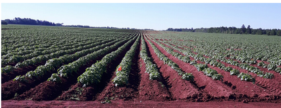
YaraVita HYDROMAG applied on the left; grower standard program on the right